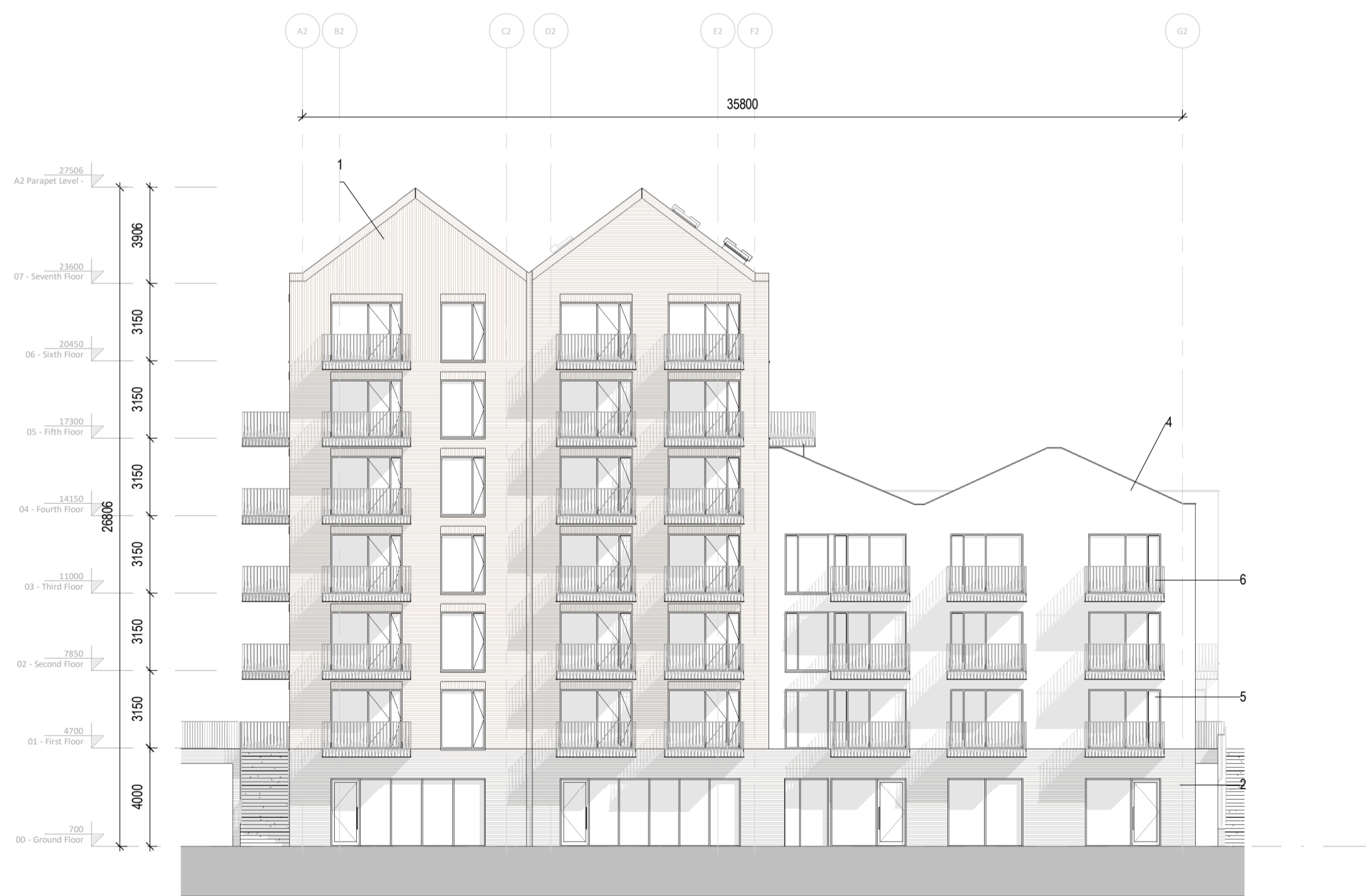
3 A2_South-West Elevation 1:200