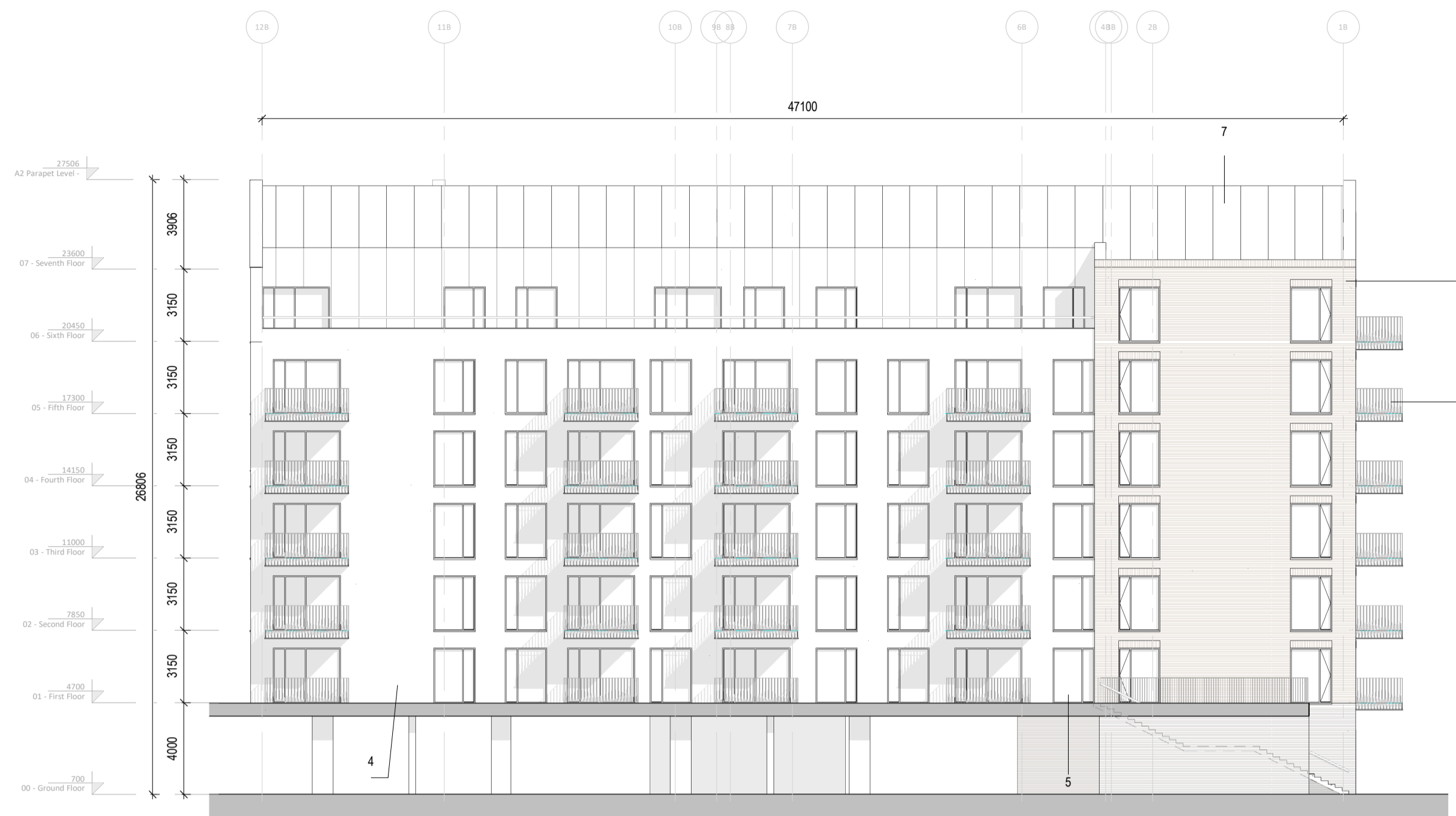
1 A2_North-West Elevation 1:200