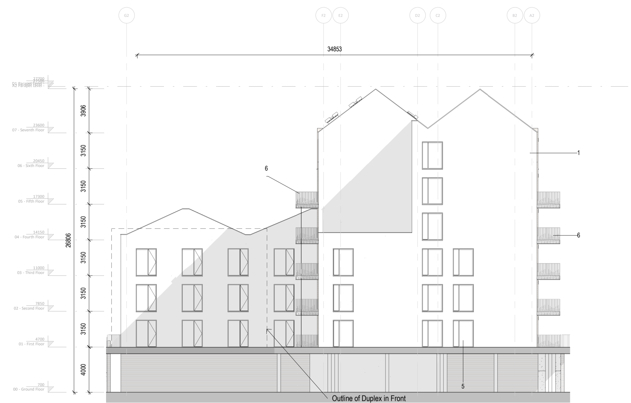
2 A2_North-East Elevation 1:200